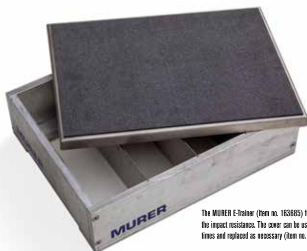
The MURER E-Trainer (item no. 163685) for simulating the impact resistance. The cover can be used multiple times and replaced as necessary (item no. 163687).